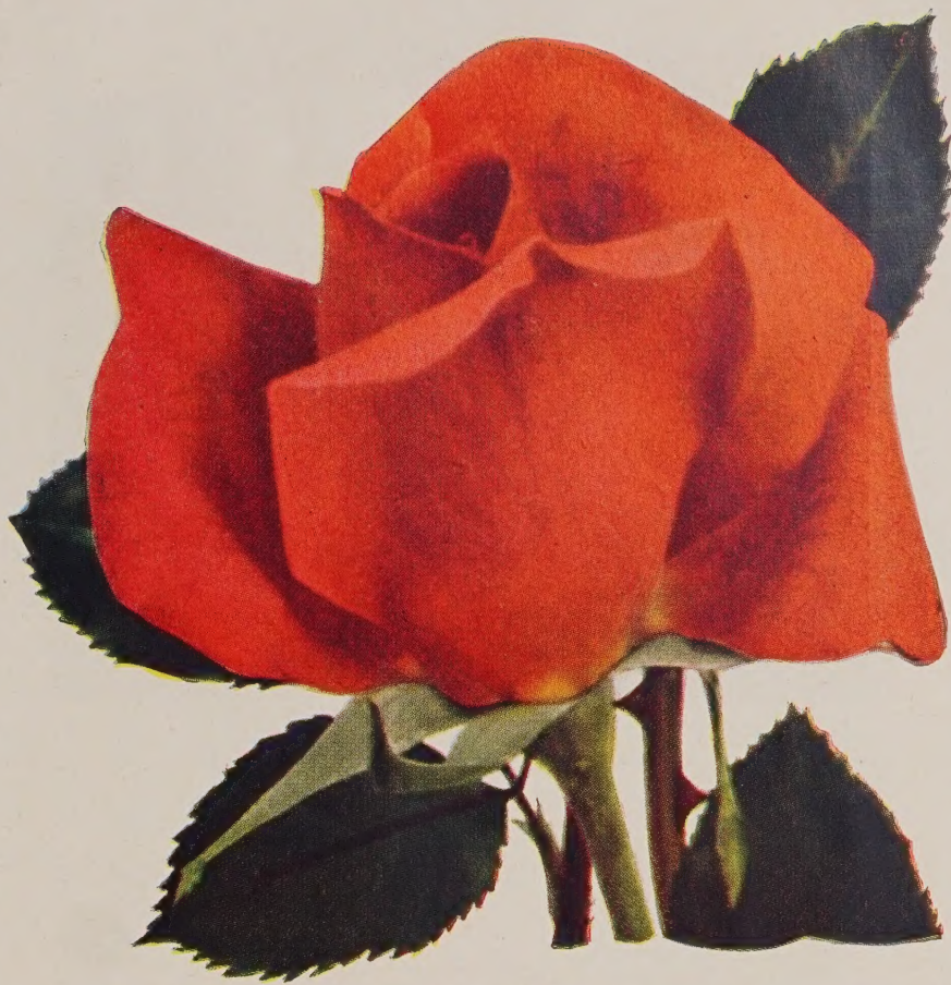
GRANDE DUCHESSE CHARLOTTE—$1.50 each; 3 for $3.75 (Patent Applied for)

ETERNAL YOUTH —Plant Pat. No. 332. Perfectly formed long-pointed buds of soft pink, with yellow at the base of each petal. The full open flowers show graceful deep yellow stamens. $1.25 each, 3 for $3.15.